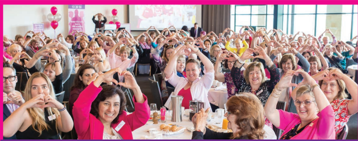
DATE SAVER - Pink Ribbon Breakfast Monday 22 October 2018