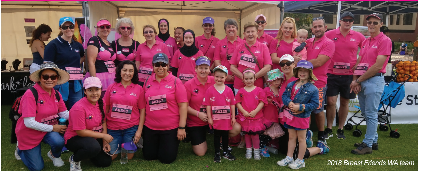
2018 Breast Friends WA team

Since 2015 BreastScreen WA's team of walkers, Breast Friends WA, have gathered together in their pink shirts at the Mother's Day Classic to raise much needed funds for the National Breast Cancer Foundation and raise awareness of BreastScreen WA here in Perth.